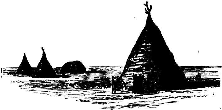
Wigwams of the natives of the Island of Jura, in the year 1772. (Copied from "Pennant's Second Tour.")

summer habitations of these Jura islanders are particularly described by Pennant, and they closely resemble the dwellings of the natives of Lochaber, as pictured by that traveller. Lochaber, which lies some distance to the north-east of Jura (though within easy reach of it by water), was stated to be the country of the "Moorish," or semi-Pictish, tribe of the Cattanachs, or Clan Chattan. Of their dwellings, at the time of his first visit to the Highlands, Pennant says: "The houses of the peasants in Lochaber are the most wretched that can be imagined; framed of upright poles, which are wattled; the roof is formed of boughs like a wigwam, and the whole is covered with sods." In his second tour he describes the summer dwellings of the Jura islanders in similar terms: "These formed a grotesque groupe; some were oblong, many conic, and so low that entrance is forbidden without creeping through the little opening, which has no other door than a faggot of birch twigs placed there occasionally. They are constructed of branches of trees, covered with sods; the furniture a bed of heath, placed on a bank of sod; two blankets and a rug; some dairy vessels, and above, certain pendant shelves, made of basket-work, to hold the cheese, the produce of the summer." The annexed woodcut is copied from the illustrations in Pennant's travels.